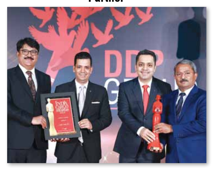
Sofitel Mumbai BKC