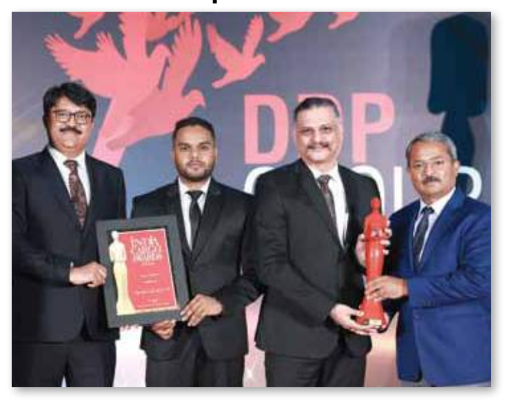
Cargo Service Center India