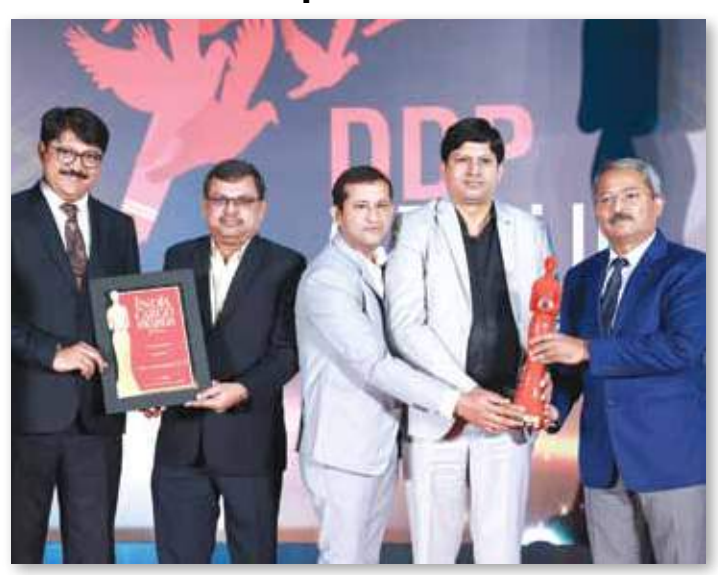
Menzies Aviation Bengaluru