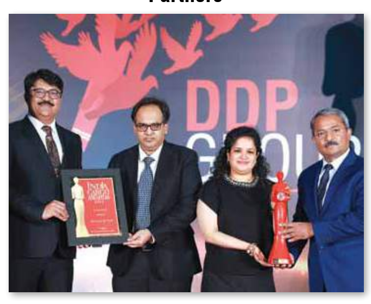
Kettro Gourmet Gifts