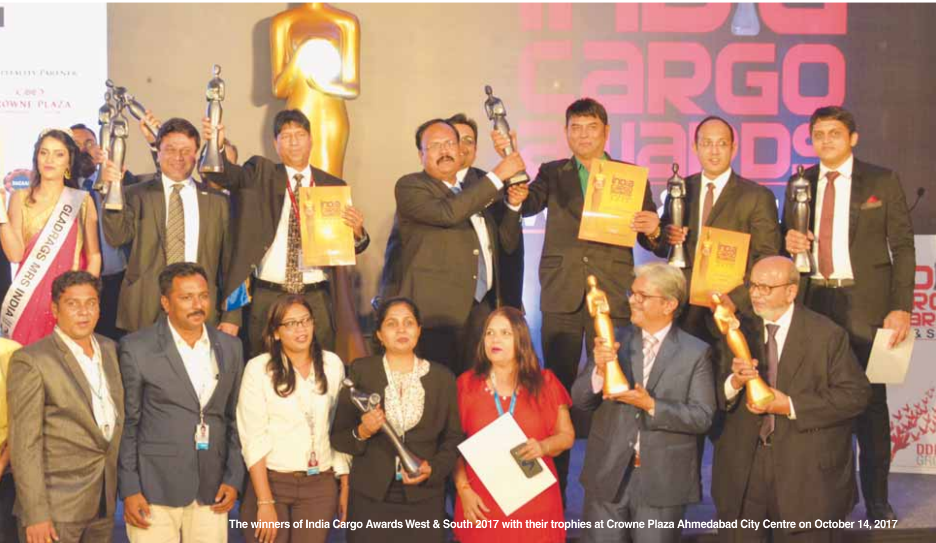
The winners of India Cargo Awards West & South 2017 with their trophies at Crowne Plaza Ahmedabad City Centre on October 14, 2017