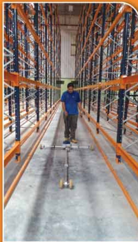
SUPERFLAT FLOOR SURVEY